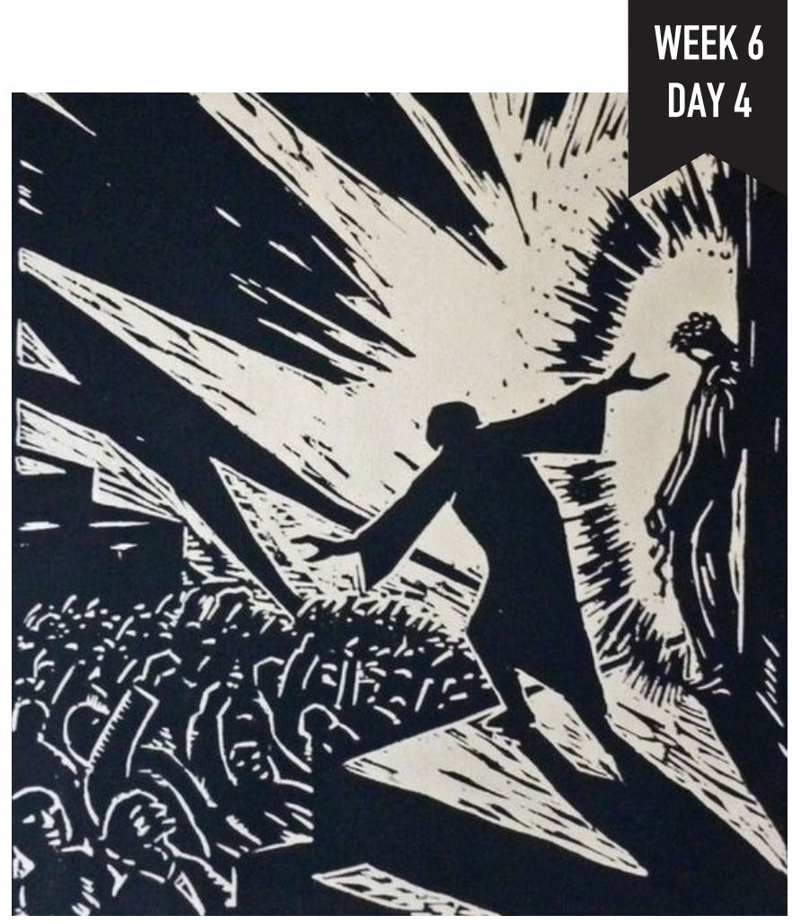
Passion by Bruno Wollbruck Verlag