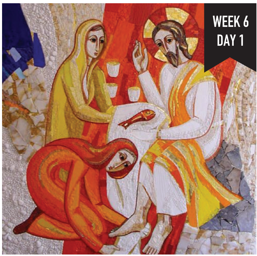
by unknown artist