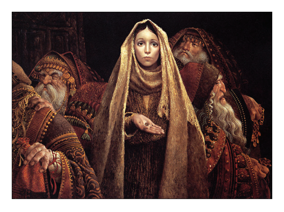
Widow's mite by unknown artist